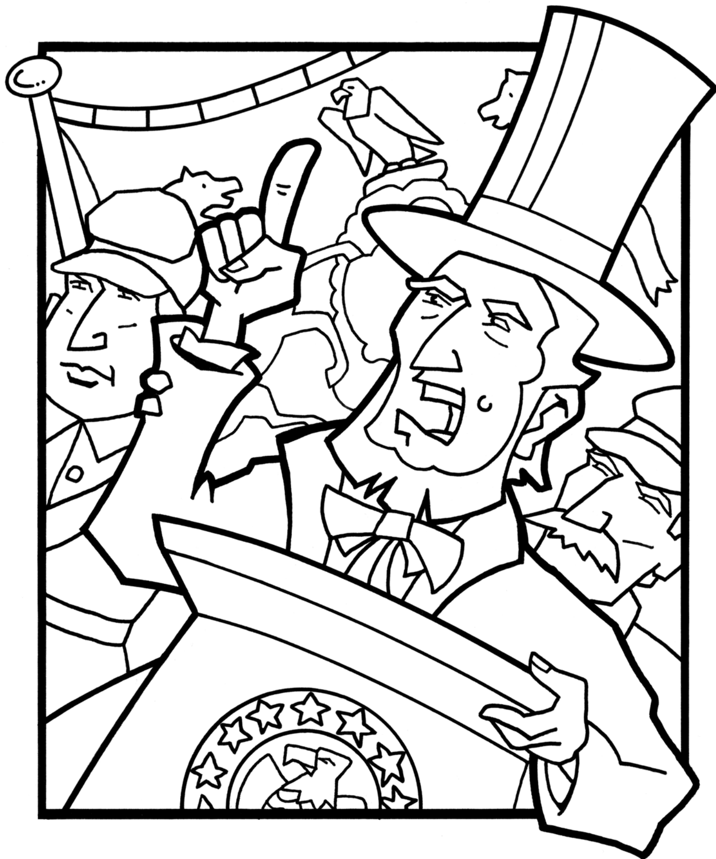
President Abraham Lincoln delivered the Gettysburg Address honoring the courageous men who fought to preserve the United States and abolish slavery.