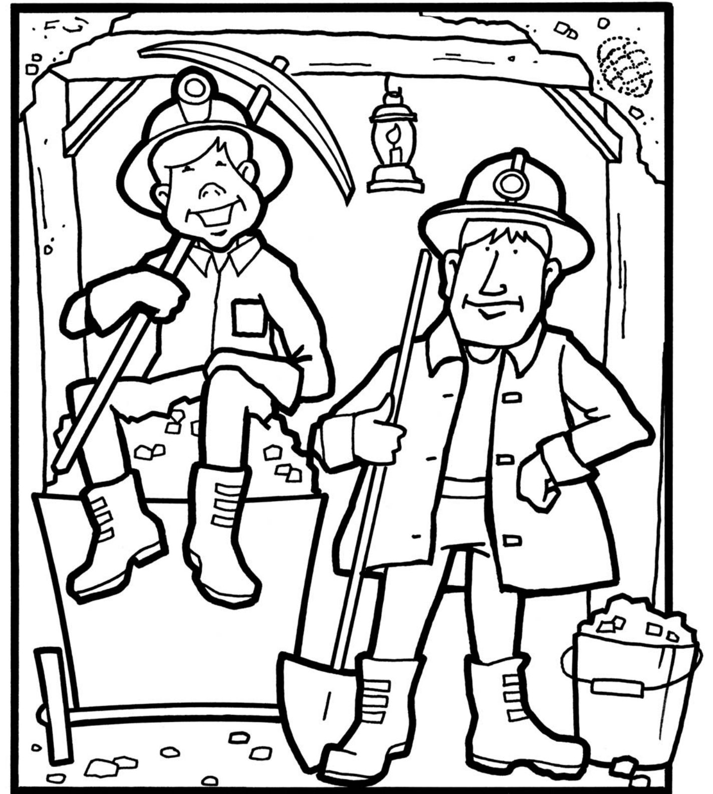
Boys as young as eight years old often helped in the coal mines of northeastern Pennsylvania.