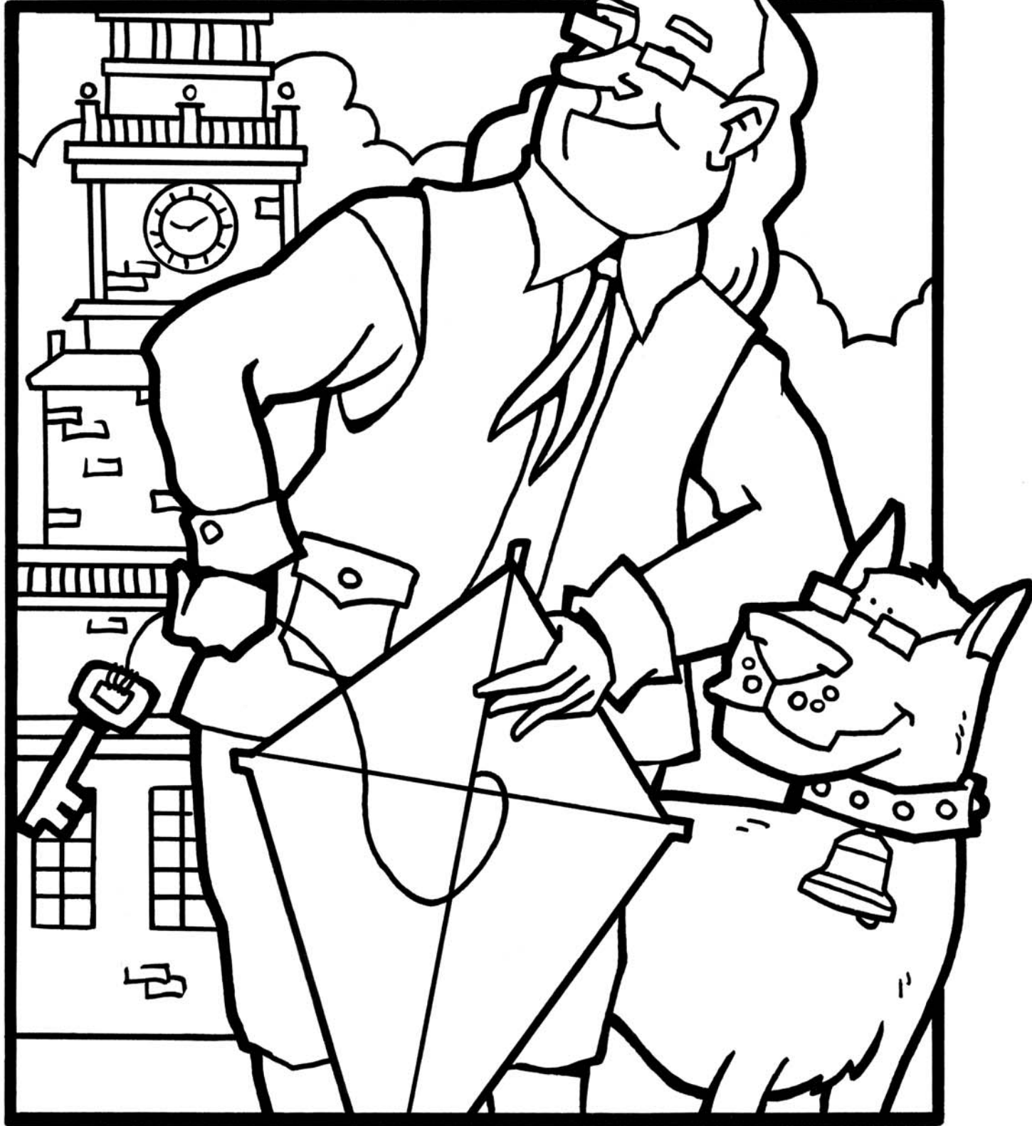
One of the greatest Americans in history, Benjamin Franklin, helped write the Declaration of Independence in The City of Brotherly Love.