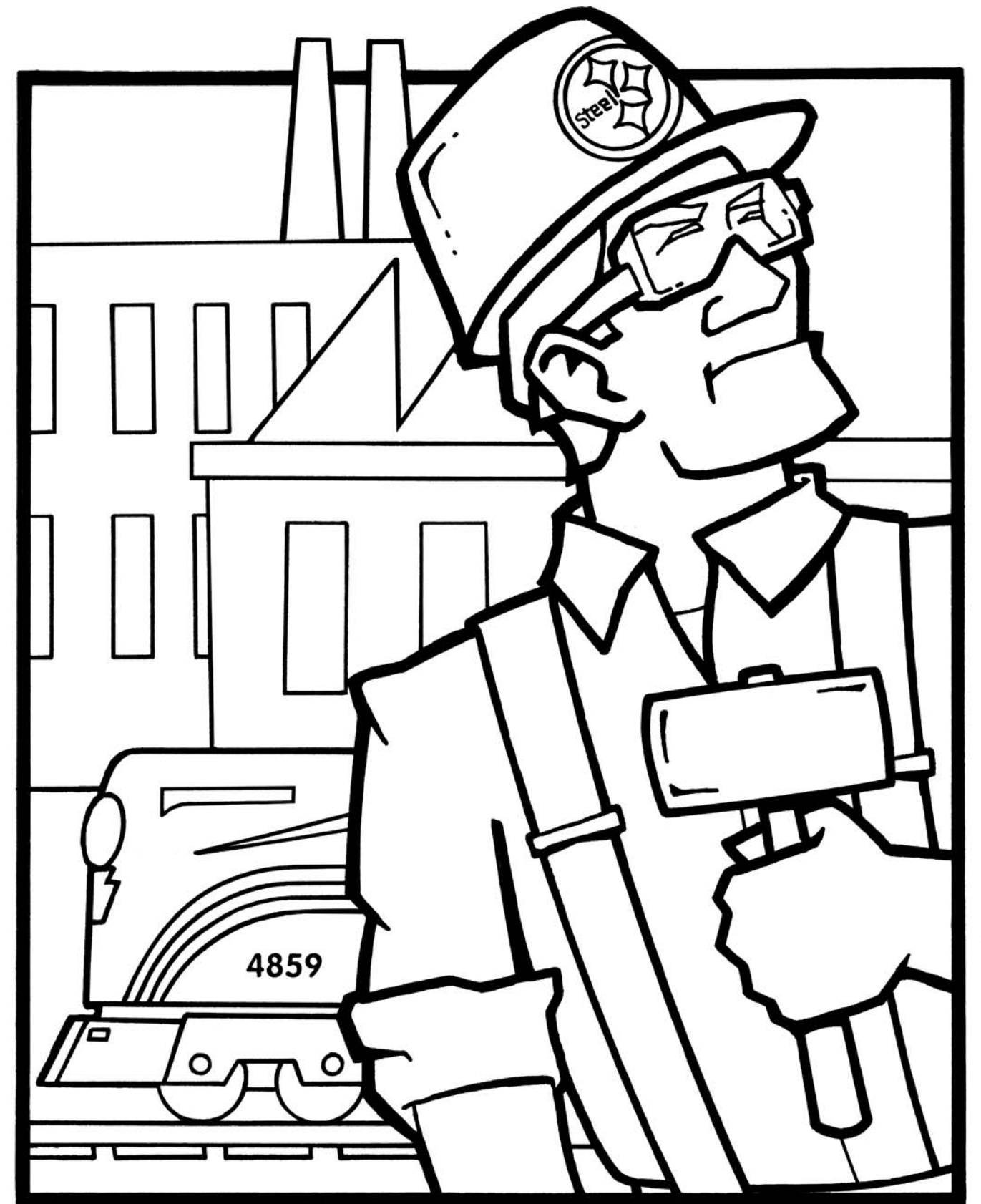
Pennsylvania's rich resources and industrial strength helped build this great nation.