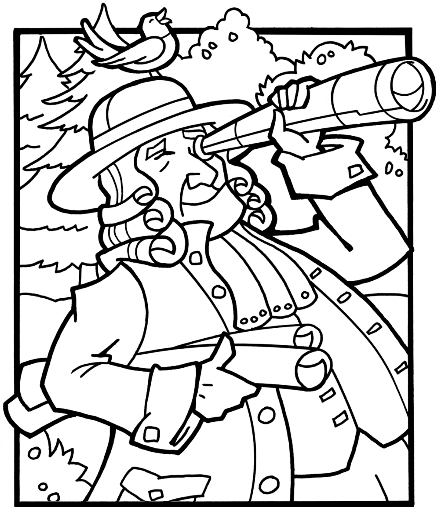
Three hundred years ago, it was known as Penn's Woods (Penn's Sylvania). And William Penn owned it all.