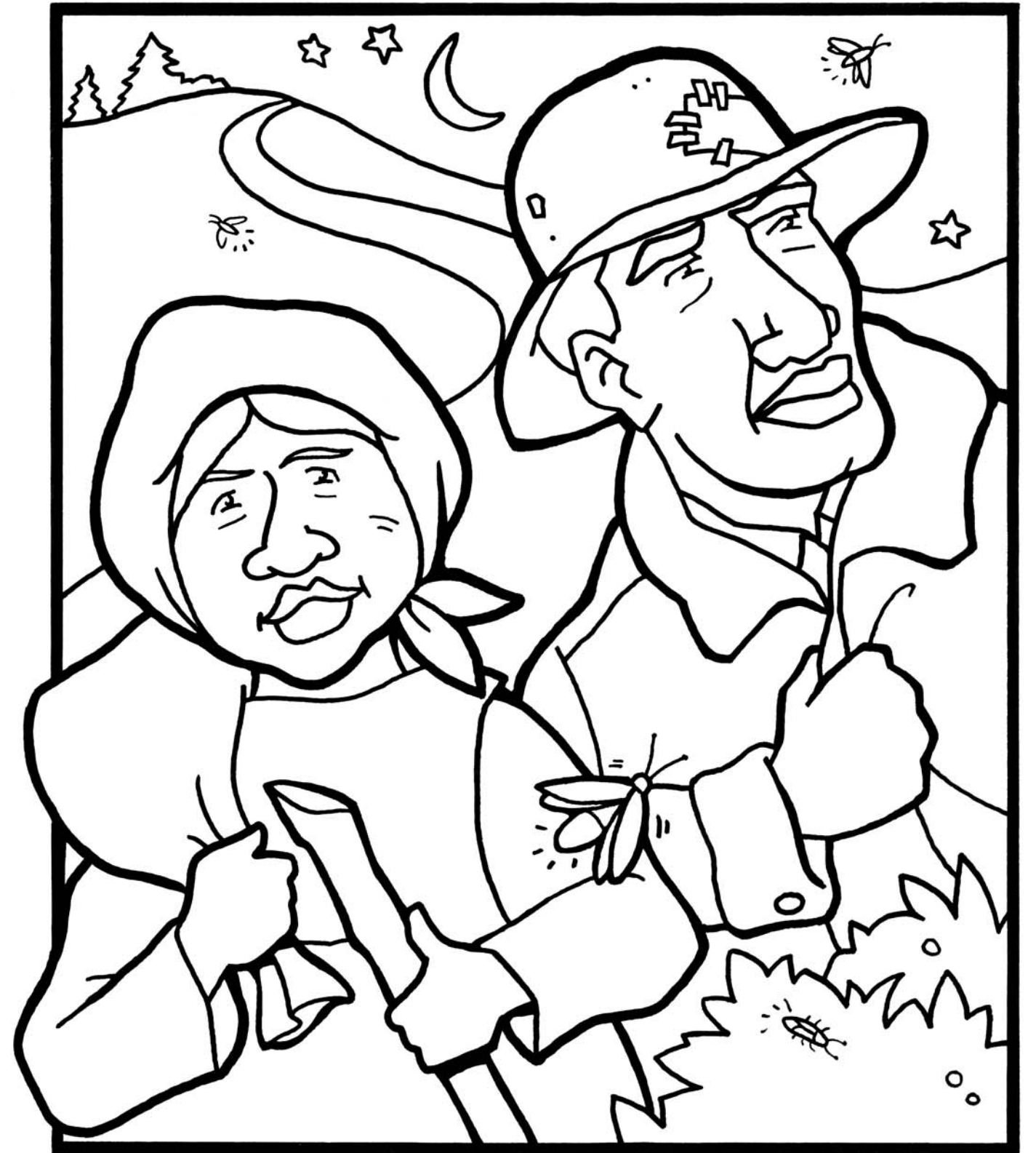
Bravehearted runaway slaves risked everything and sought their freedom by traveling north through Pennsylvania on the "Underground Railroad."