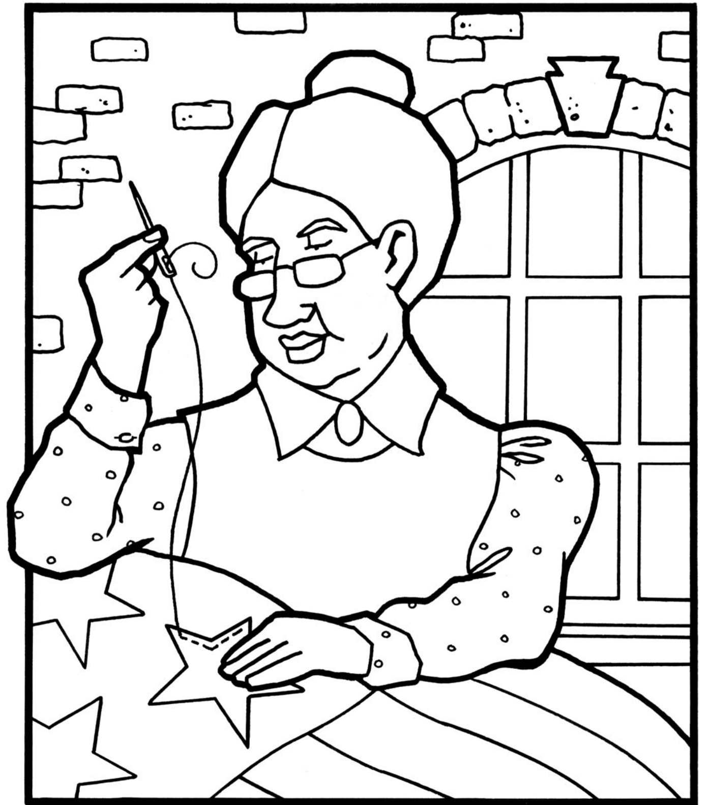
A symbol of liberty, freedom, and pride, Betsy Ross sewed the nation's first flag in Philadelphia.