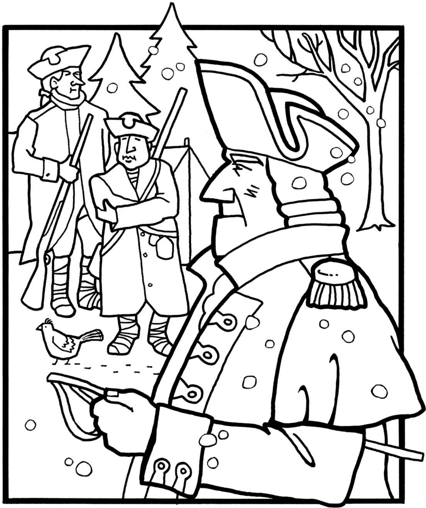
General George Washington—First in War, First in Peace, and First in the Hearts of His Countrymen—encamped at Valley Forge.