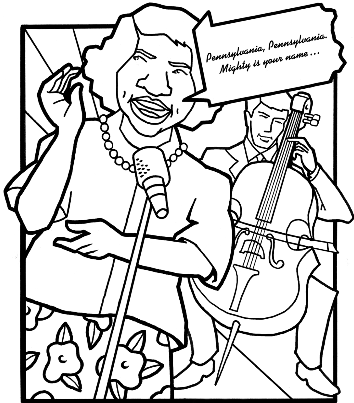
Philadelphia opera legend, Marian Anderson, had a voice "heard once in a hundred years."