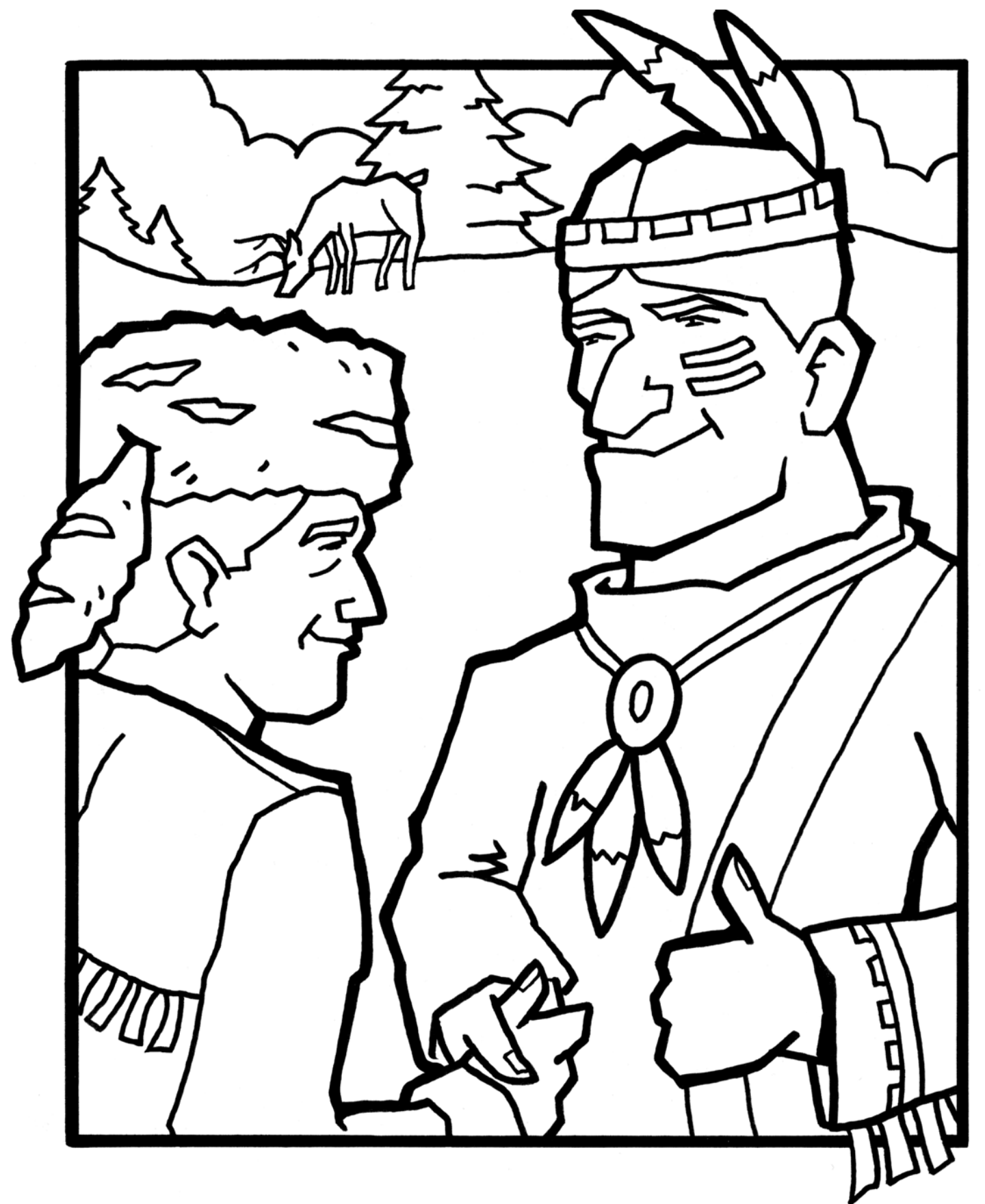
Berks County native son and frontier hero, Daniel Boone, blazed the trail for settlers moving west.